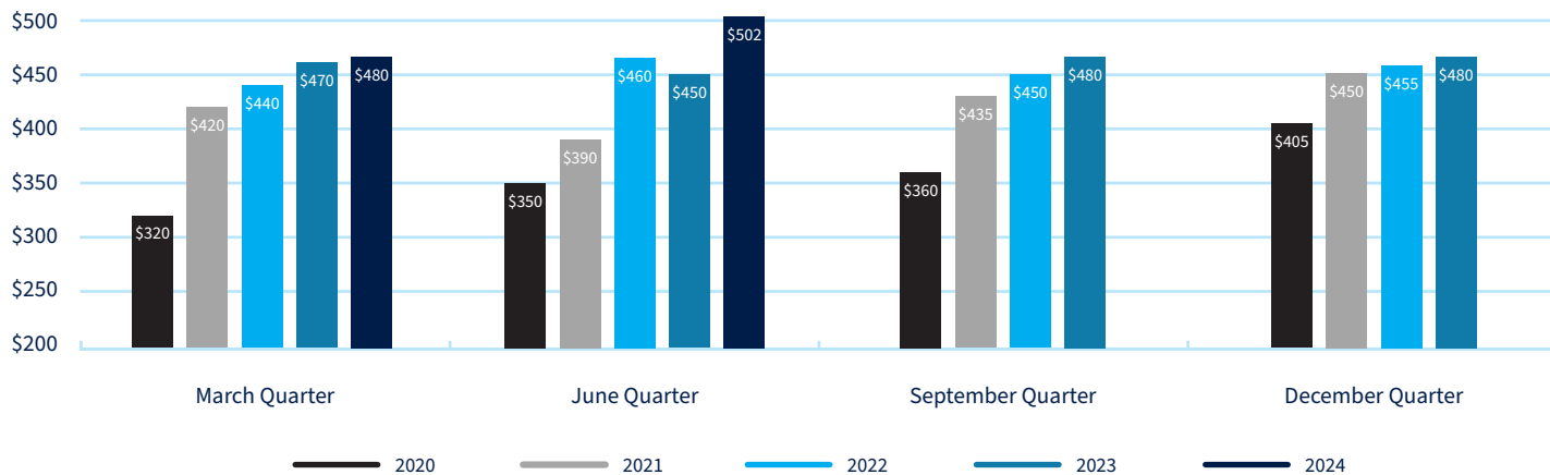
Long Term Trend 3 Bedroom Median Rents